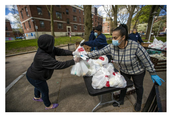
FREE Meals for Youth and Families