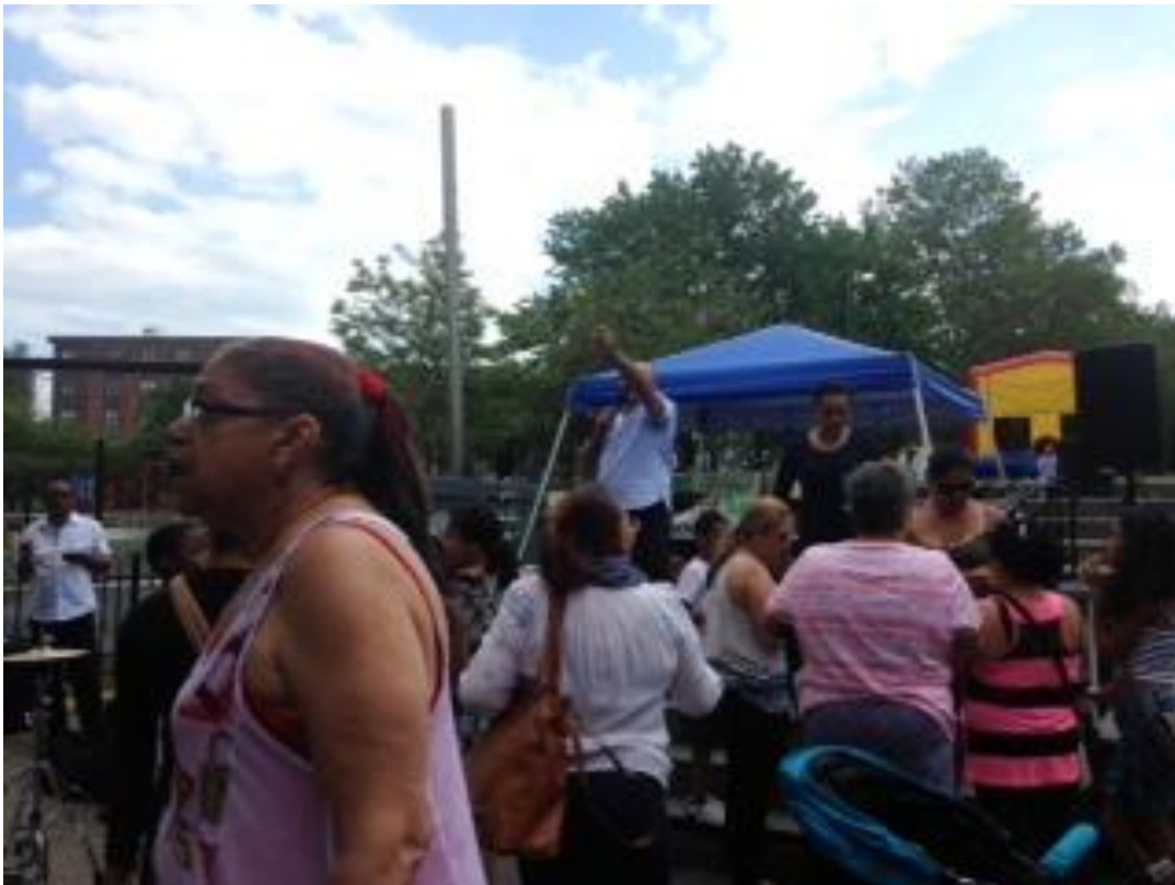
Mildred Hailey Jazz Art Unity Day Festival.

This manual contains information about partners that are established within the Mildred C. Hailey Development. Partners are defined as those agencies that provide financial and concrete resources on an ongoing basis with professional expertise. These Partnerships promote resident engagement, workforce development, continuing education, and community service.