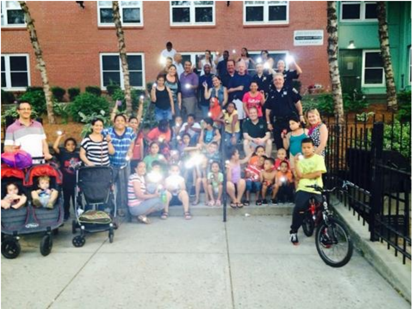
Boston Police Department Area District E-13 Flashlight Walk